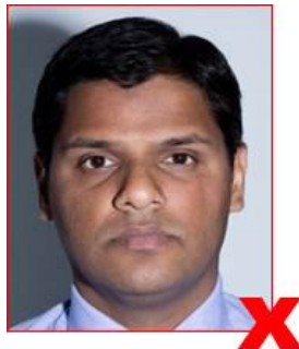
No shadows on face