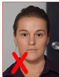
Background should be plain white