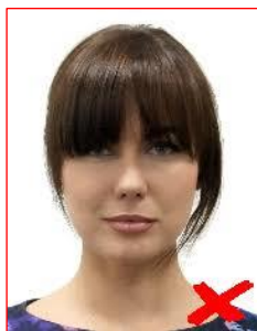
Hair must not cover face