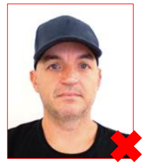
Hat must not be worn